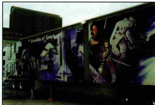
NASA's Benefits of Space Exhibit was on display at the Eighth Biennial National Health Occupations Curriculum & Research Conference.

resources, skills and expertise. States were represented from Hawaii to New York and from Alaska to Florida!